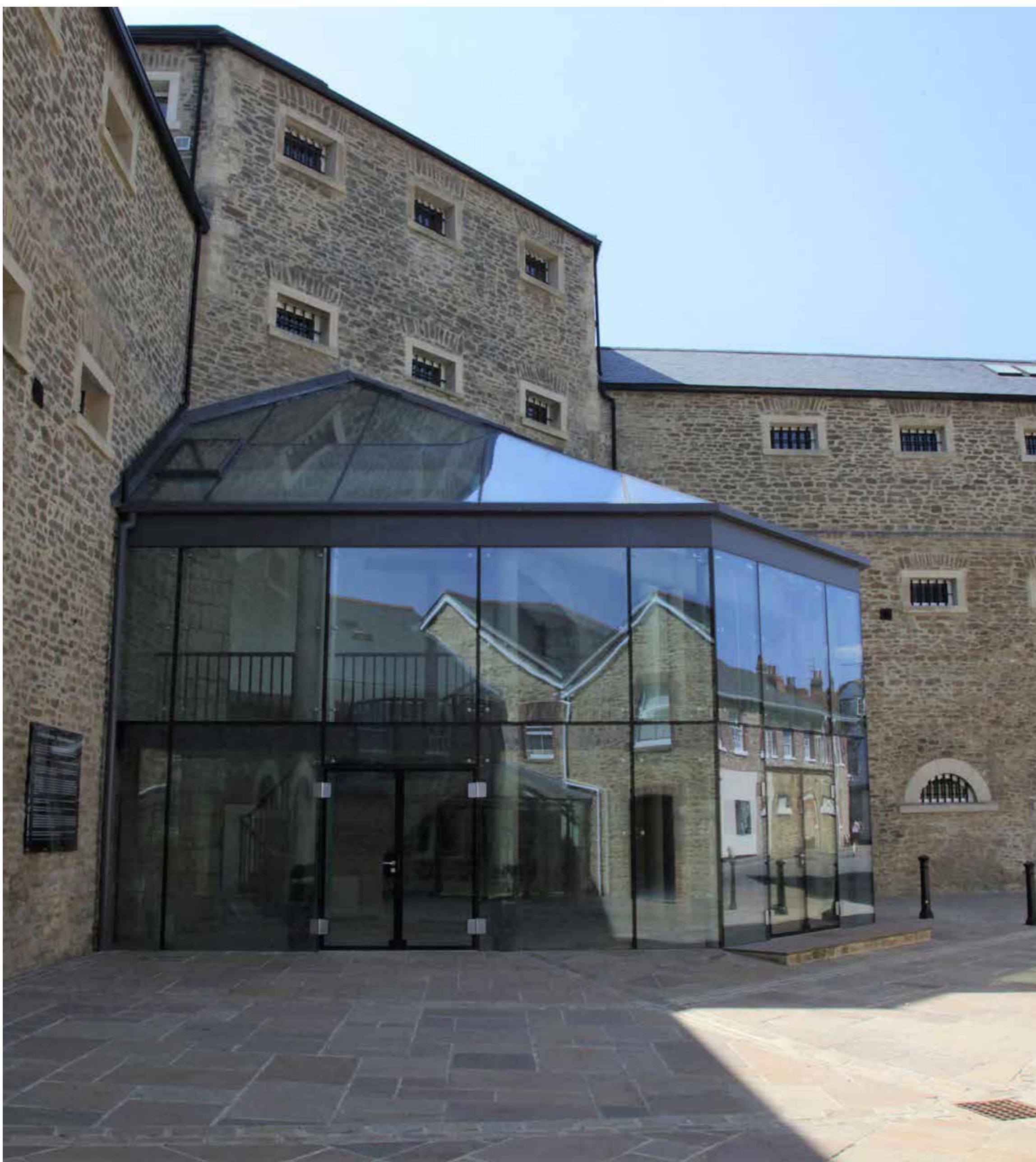
The Old Gaol - Main entrance

We would very much welcome your comments on these draft proposals to inform our planning application submission to the local planning authority in May 2022. A further breakdown of project timescales is as shown at the bottom of this page.