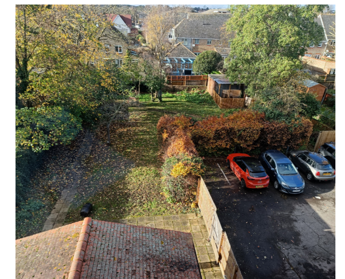
View over Garden