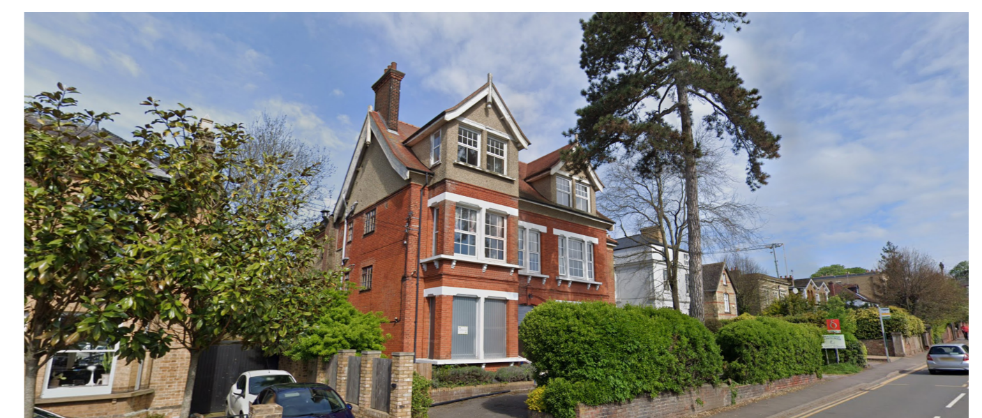
View From New Road